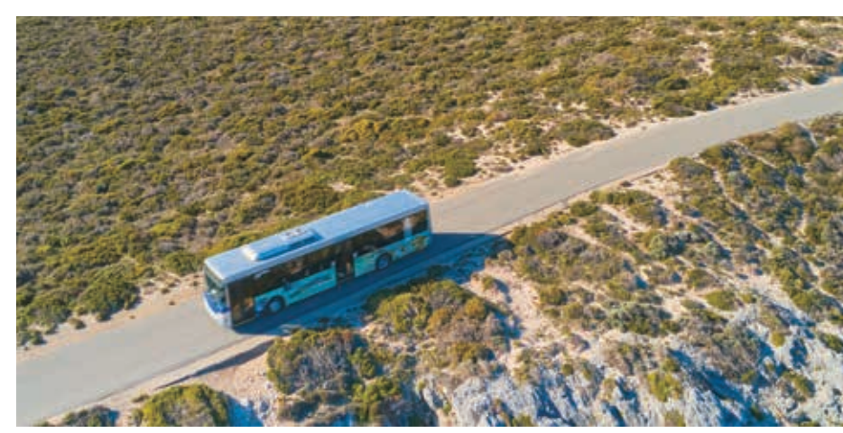
Island Explorer Bus