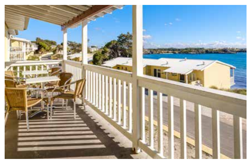
Stay Rottnest Self-Contained Accommodation

<u>Discovery - Rottnest Island</u> <u>Samphire Rottnest</u> <u>Stay Rottnest Hostel & Dorms</u> Stay Rottnest Self Contained Accommodation