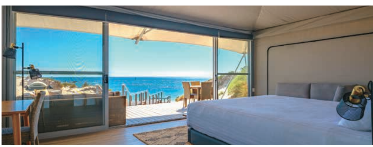
Discovery - Rottnest Island