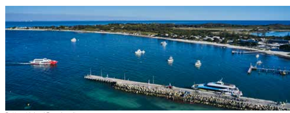
Rottnest Island Ferry Landing

Departing Fremantle or Perth — Transfers take approximately 30 or 90 minutes.