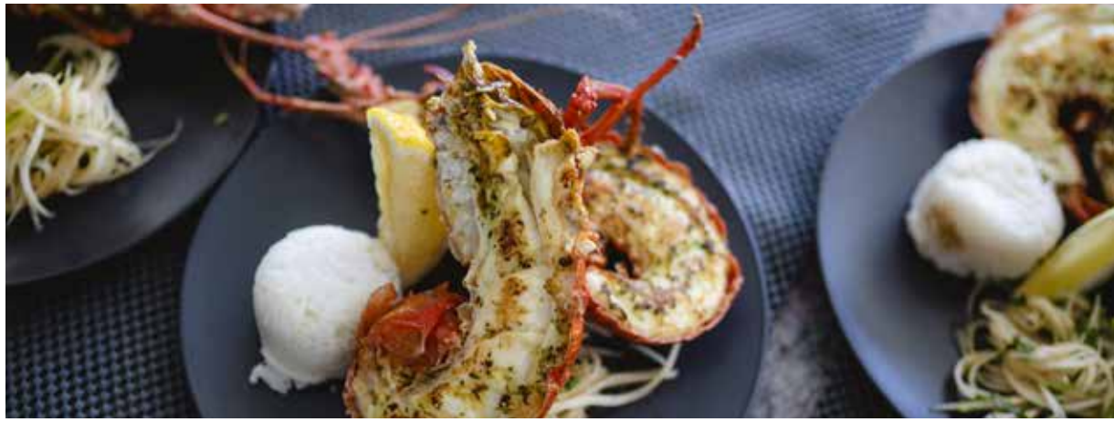
Restaurant dining on the island

Frankie's on Rotto Hotel Rottnest Isola Bar E Cibo Lontara Pinky's Rottnest Island