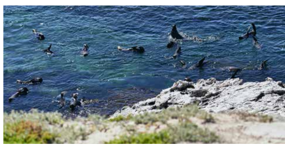
Long-nosed fur seals