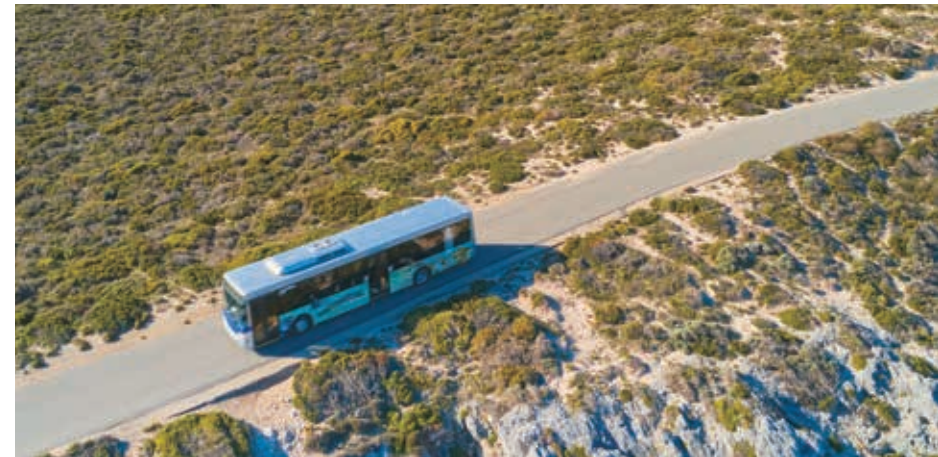
Island Explorer Bus