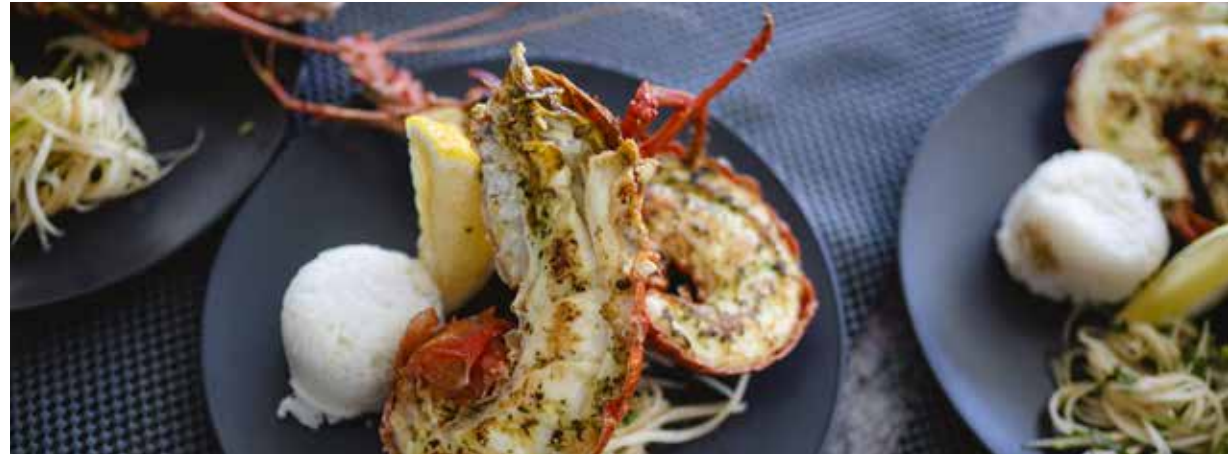
Restaurant dining on the island