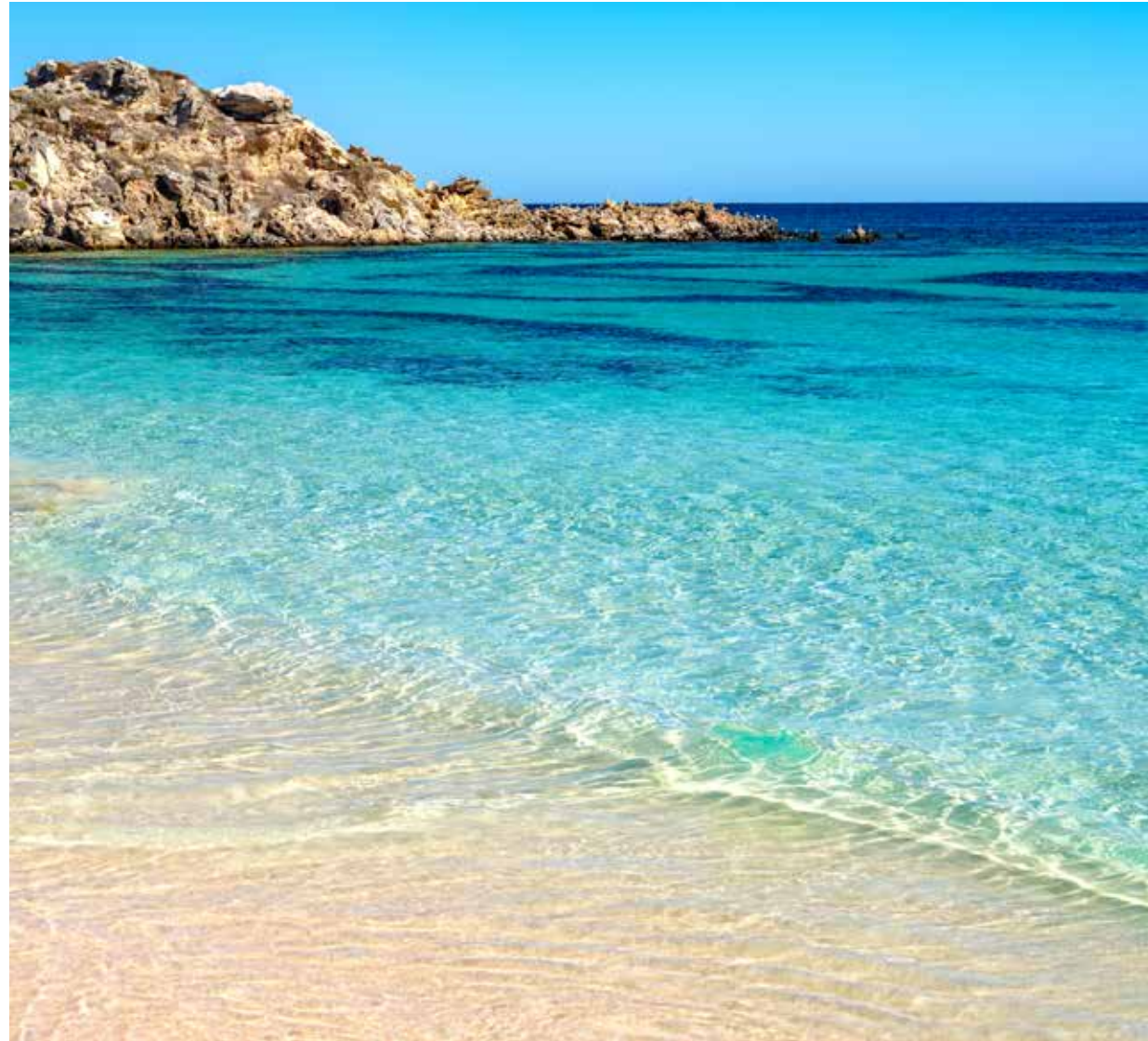
Salmon Bay (Cakewalk)