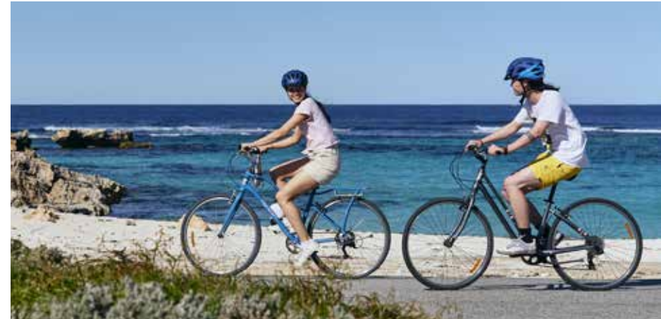
Bicycles are the preferred mode of transport

There's no shortage of ways to acquaint yourself with the island's abundant wildlife and remarkable landscapes, as well as the many species of marine life inhabiting our many pristine beaches.