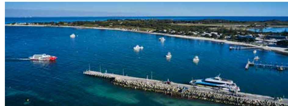
Rottnest Island Ferry Landing

Departing Fremantle or Perth — Transfers take approximately 30 or 90 minutes.