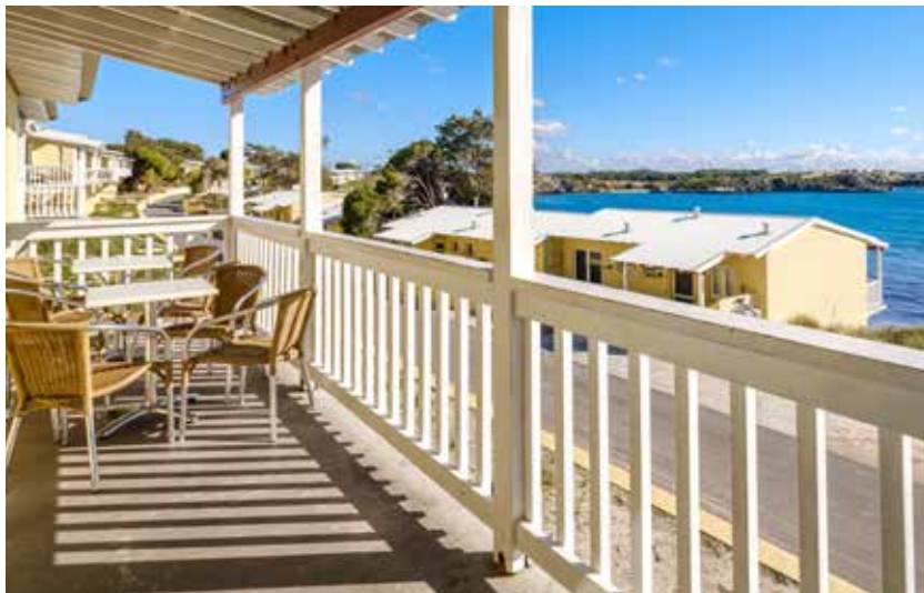
Stay Rottnest Self-Contained Accommodation