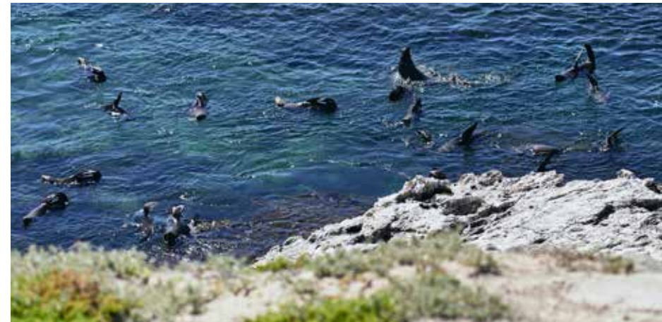
Long-nosed fur seals