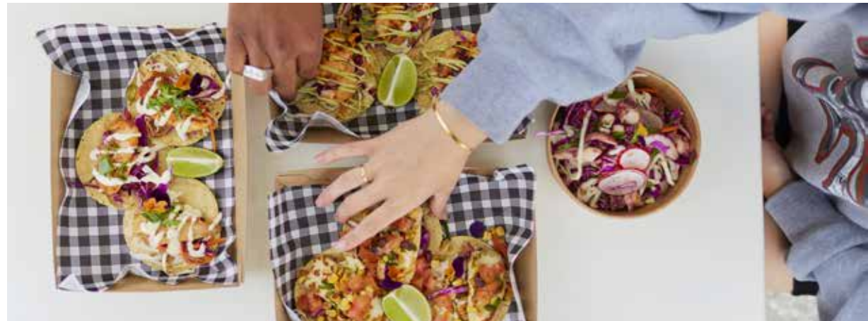
Relax at one of the popular cafés