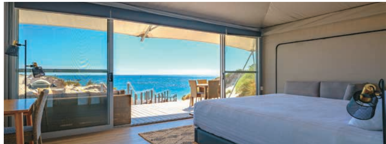
Discovery – Rottnest Island